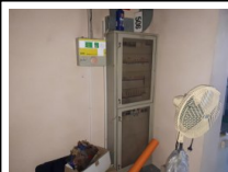
#32: Alarm System