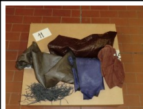
#90: Various Scraps