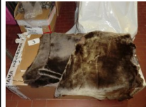
#86: Lot of Pelli