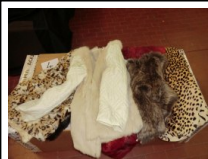
#87: Outerwear and Cut outs