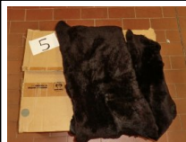
#88: Climbing in Montone