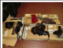
#89: Climbing in Montone