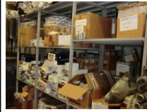
#85: Accessories for Garments