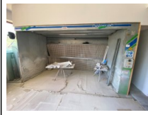
#29: Olimpia Titano Painting Booth

Marca: Olimpia modelo: Titano Año: 1998 Rif: 88